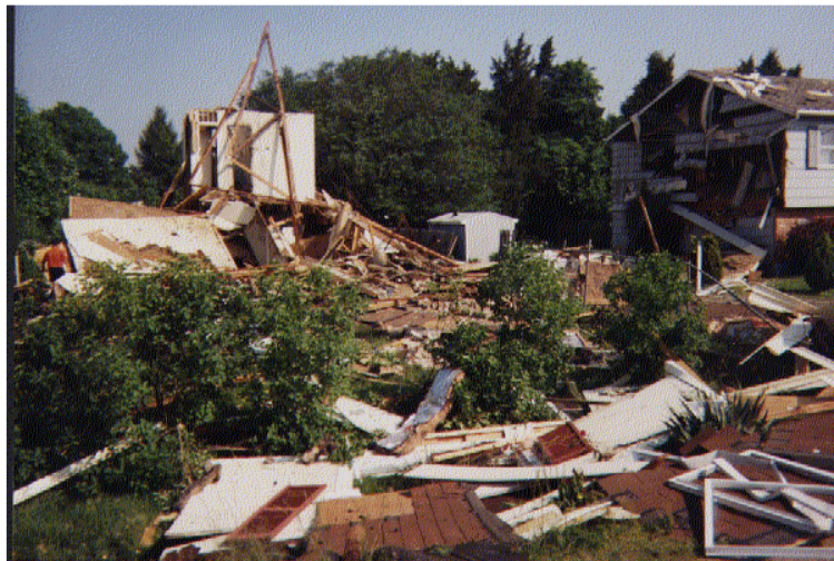
(House destroyed by a gas explosion)

Damage to an underground utility line can result when a person fails to call Miss Utility prior to excavating. The damage can be a nick to a gas line causing gas to escape underground and follow the path of least resistance into a home. Any source of ignition can then create a potentially deadly explosion inside the house.